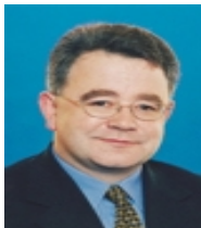
Seán Ó Fearghail (FF)