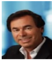
Alan Shatter (FG)