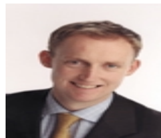
Barry Andrews T.D. Minister of State for Children and Youth Affairs ( ex officio )