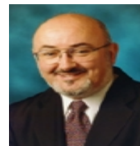
Caoimhghín Ó Caoláin (SF)