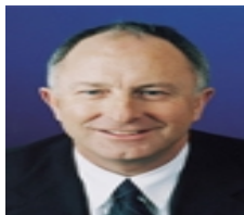
Dermot Ahern T.D. Minister for Justice, Equality and Law Reform ( ex officio )